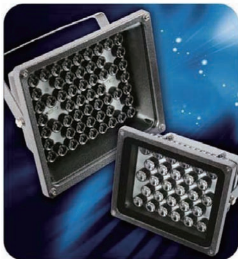
Conical Illumination 照度分布図